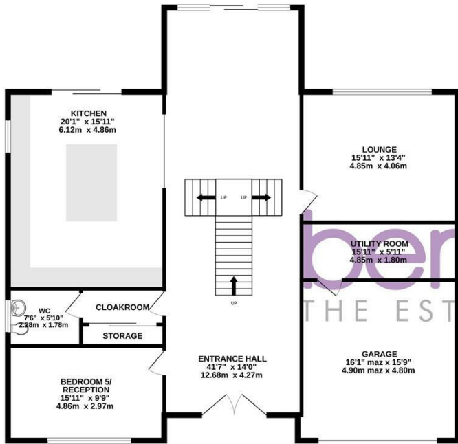
GROUND FLOOR 1719 sq.ft. (159.7 sq.m.) approx.